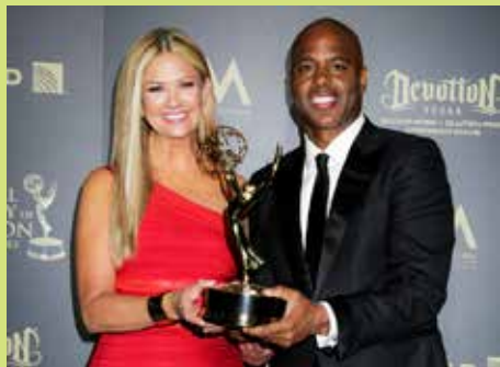
Nancy O'Dell and Kevin Frazier of Entertainment Tonight , winner of Outstanding Entertainment News Program at THE 44TH ANNUAL DAYTIME EMMY AWARDS in 2017