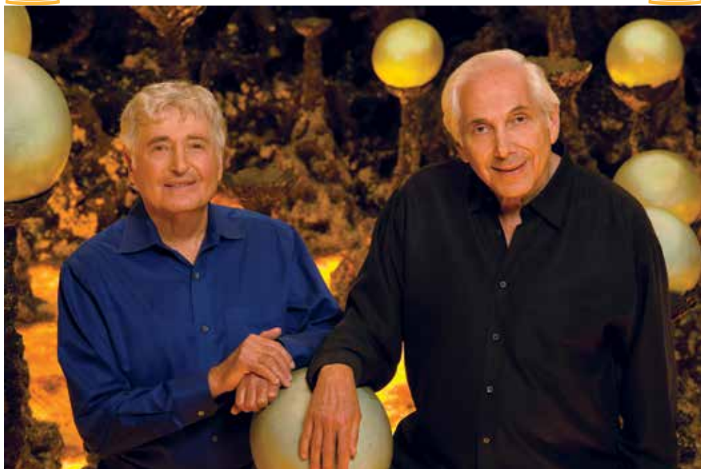
Sid and Marty Krofft

3962 LAUREL CANYON BLVD. STUDIO CITY, CALIFORNIA 91604 818.509.9541 / 818.509.8932 nucolor@nucolor.com / nucolorinc.com